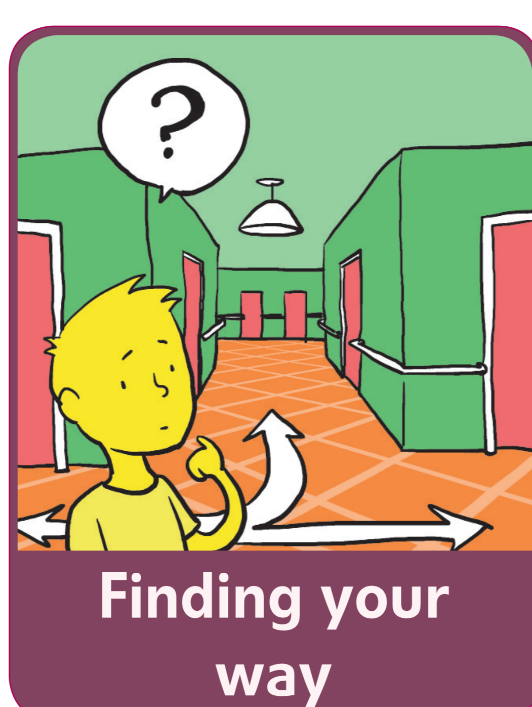
Finding your way

See what others are saying and share your story at careopinion.org.uk