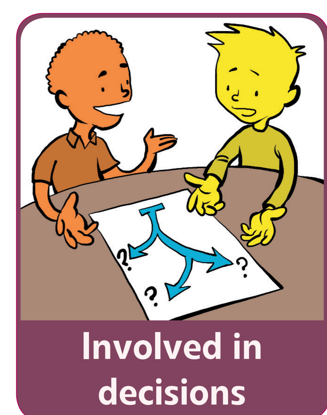
Involved in decisions